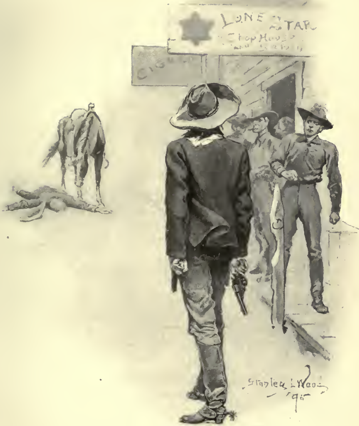
SAM LOOKED SAVAGELY AROUND HIM. —Page 191.